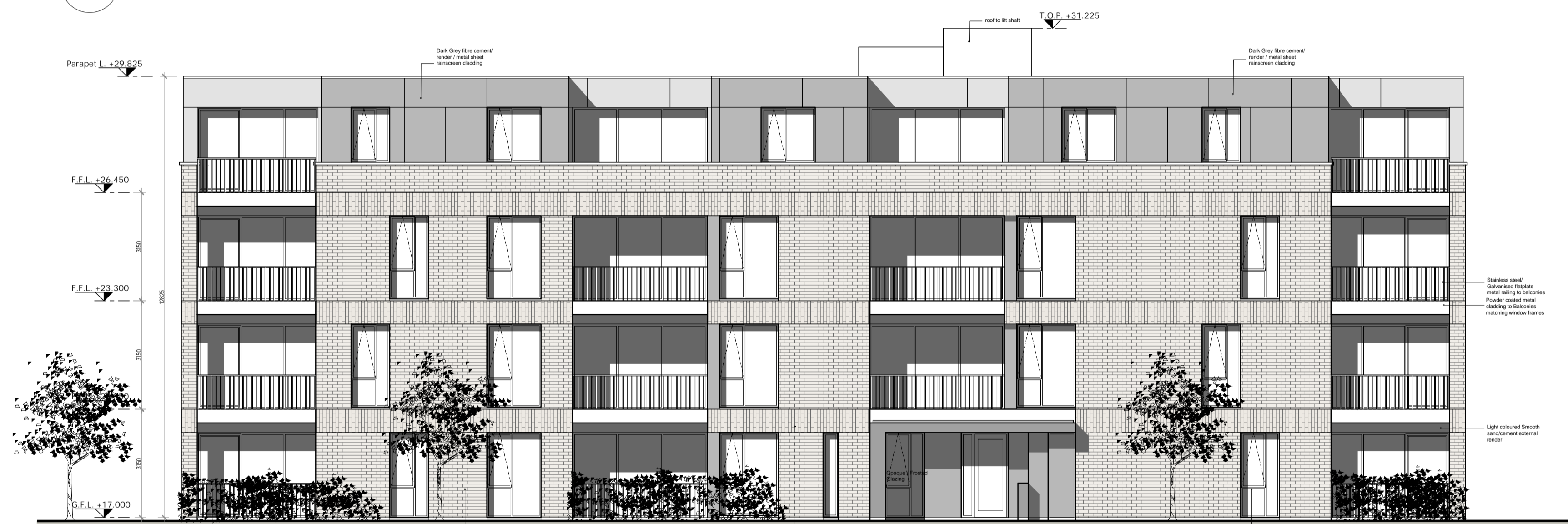
02 Western Elevation Scale 1:100